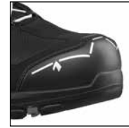
HAIX® Composite Toe Cap