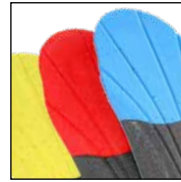
Vario Wide Fit System